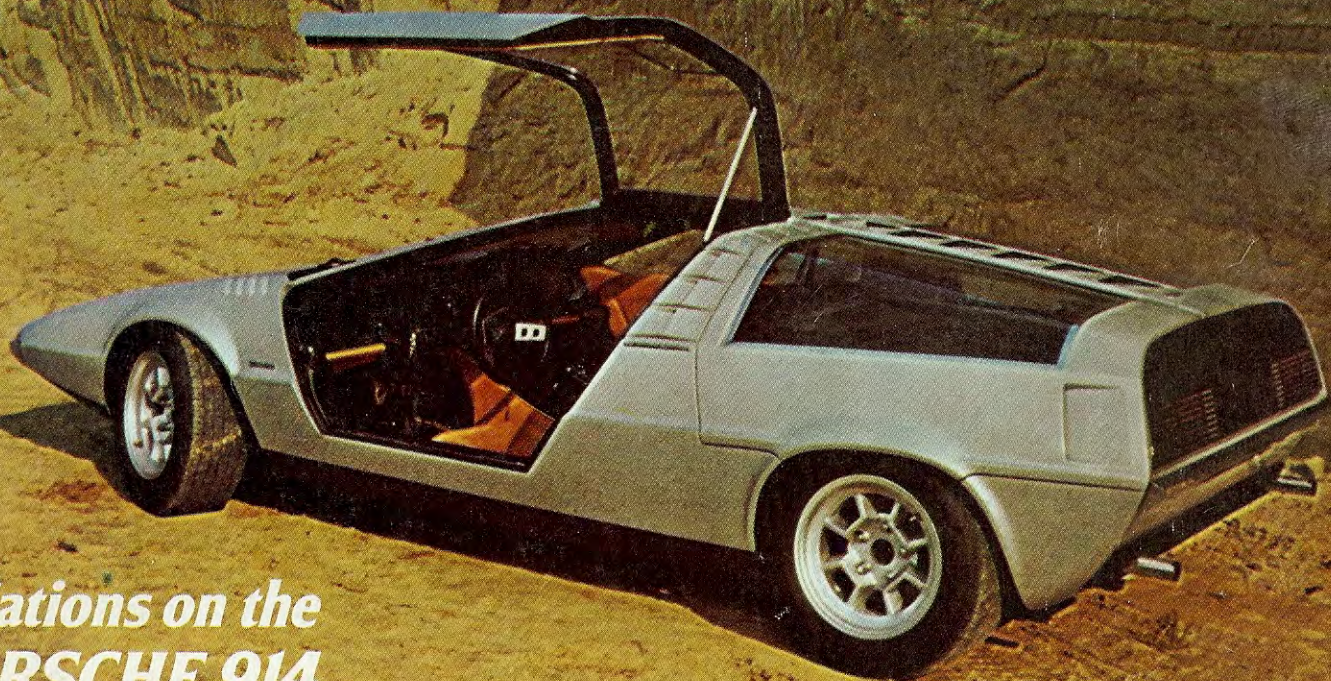
Variations on the PORSCHÉ 914 by Giugiaro

OWNER SURVEY: HOW RELIABLE IS THE FORD MUSTANG? PERFORMANCE EQUIPMENT & ACCESSORIES FOR THE VOLVO