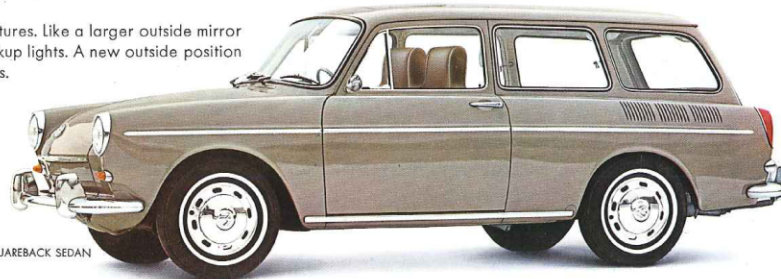
THE '68 VOLKSWAGEN SQUAREBACK SEDAN