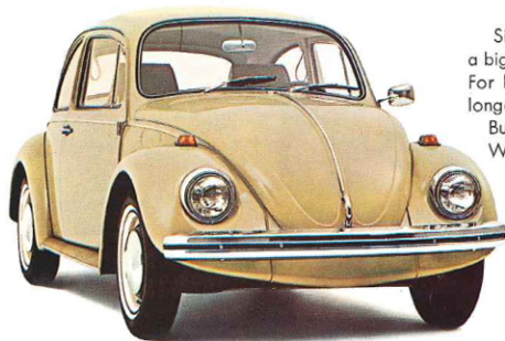
THE '68 VOLKSWAGEN SEDAN

Since you bought your VW, we've put a bigger, stronger engine in the bug. 53 hp. For better hill climbing. And passing. And longer wear.