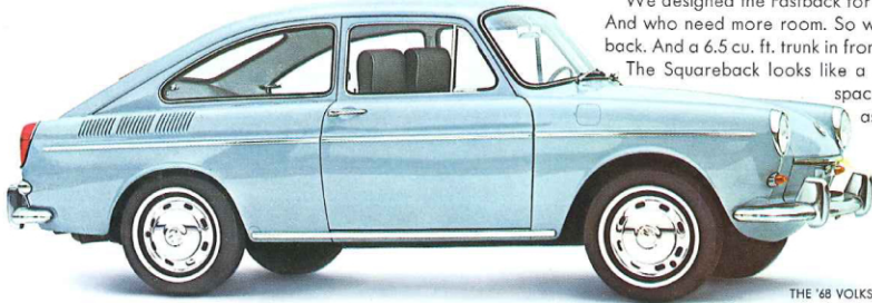
THE '68 VOLKSWAGEN FASTBACK SEDAN

But if you want to see for yourself, better come to the showroom. Where they're standing still.