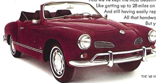
THE '68 VOLKSWAGEN KARMANN GHIA CONVERTIBLE