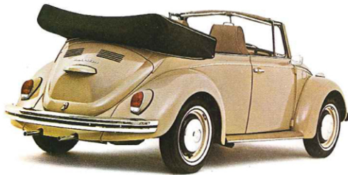
THE '68 VOLKSWAGEN CONVERTIBLE

So when a Beetle passes you by, you won't mind. It's an old friend.