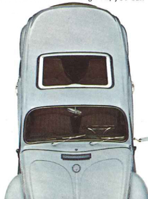
THE '68 VOLKSWAGEN SUNROOF SEDAN

And if that's still not enough air, you can