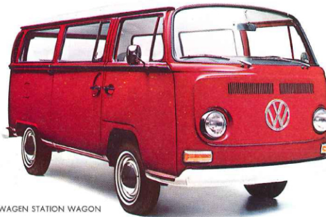
THE '68 VOLKSWAGEN STATION WAGON

So when the new Box passes you by, you'll know the old one hasn't passed away. Not entirely.